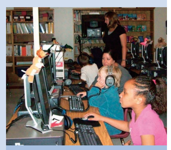
During the summer literacy program, students play literacy games on BrainPOP, an animated educational website for children.